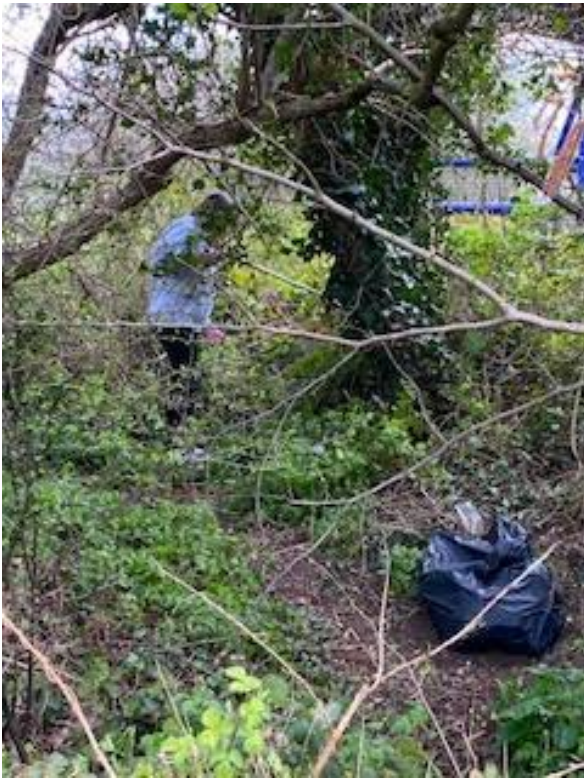
Volunteer at Purwell in search of embedded

much the Facebook questioner would be prepared to see added to their council tax in order to pay for a comprehensive clean-up. Maybe there are council services that they don't use for which they resent paying. They might believe that the contractors should be made to work harder. If the rubbish was not removed, what would be the consequence? There is evidence from Keep Britain Tidy that, when visiting locations where litter is obvious, people think it doesn't matter if they too don't take their litter home.