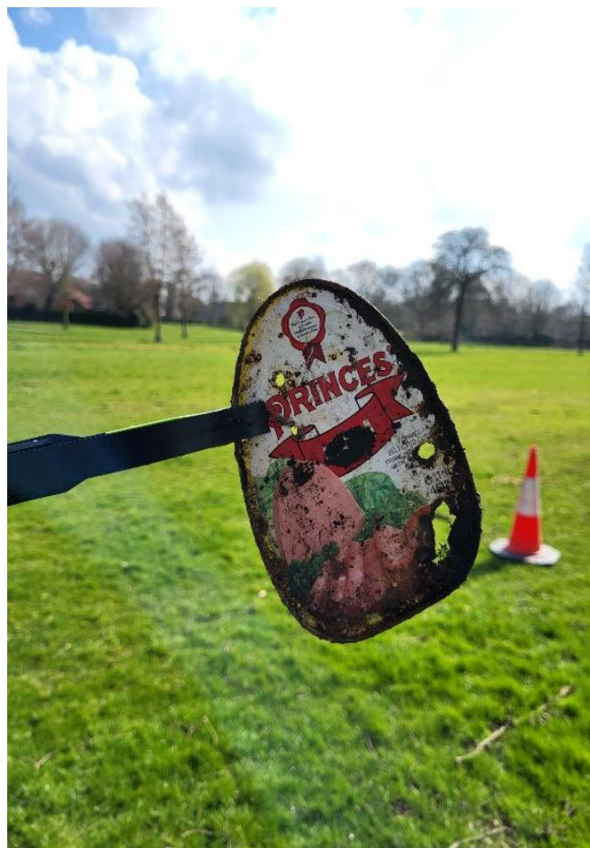
Heavily rusted remains of a spam tin found on Butts Close

Should the Council (through its contractors) be doing this? The details of North Hertfordshire's contract with either its ground maintenance contractor (John O'Conner) or contractor responsible for emptying bins and street cleaning other than on green spaces (now Veolia, but previously Urbaser) are unavailable. Obviously, the terms of the contracts will be constrained by budget. I wonder how