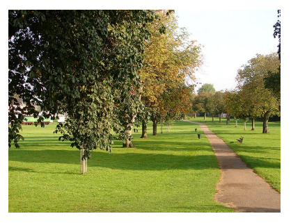
FRIENDS OF BUTTS CLOSE